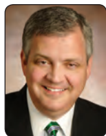
Albert Mohler, Jr.

President of The Southern Seminary Louisville, Kentucky