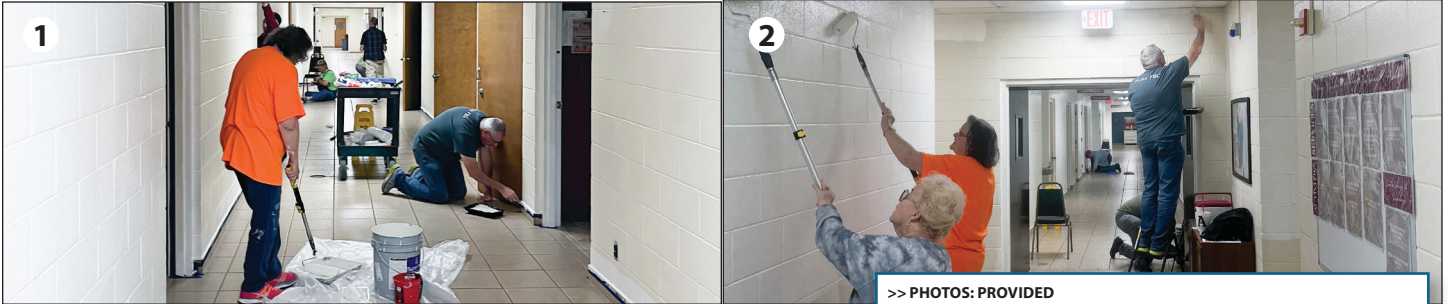
1-2) Members of Tulsa, First help with painting and repairs at The Spring; 3) The staff of The Spring help provide advocacy, a safe escape and ongoing Christlike care.