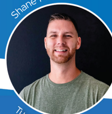
Tuesday, March 5