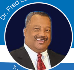
Tuesday, March 5

WANT TO RECEIVE THE BAPTIST MESSENGER FOR FREE?