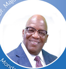
Monday, March 4