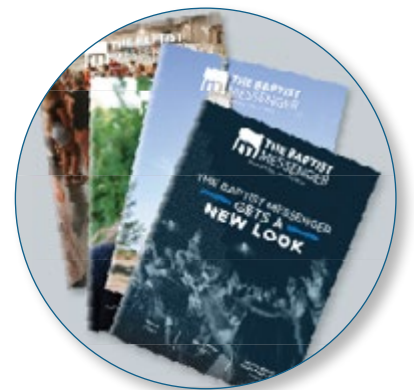
Subscribe to the Messenger Magazine for Free! baptistmessenger.com/ subscriptions