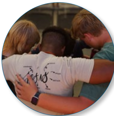
Falls Creek: The True Groundwork is Prayer by Todd Sanders