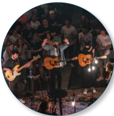
April Retreats Make Gospel Impact by Staff