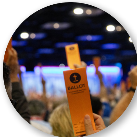
2024 SBC Meeting Highlights by Staff