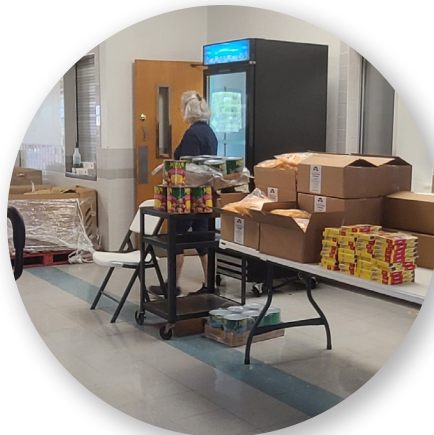
Marietta Food Pantry