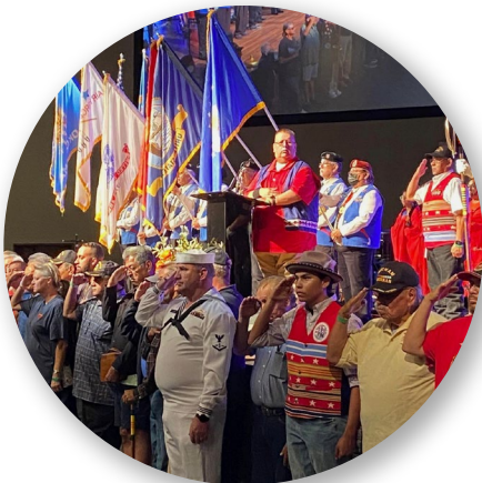
2024 Indian Falls Creek