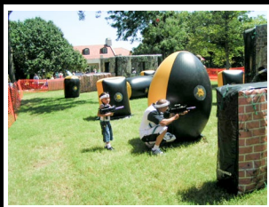
LASER TAG GAMES FOR ALL AGES!