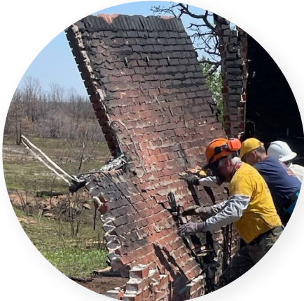
DR Wildfire and Tornado Cleanup Efforts Continue by Messenger Staff