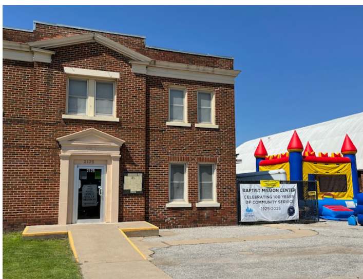
Baptist Mission Center, located at 2125 Exchange Ave.