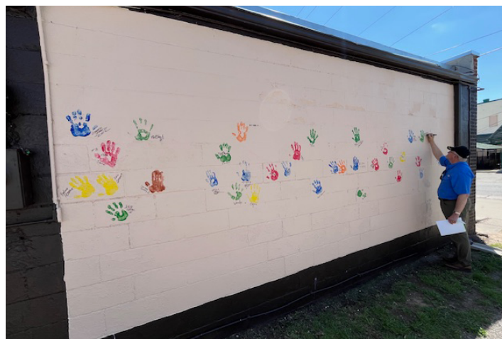
Volunteers were asked to dip their palms in paint and leave their handprints on the Mission wall as part of the “Hands Up” Project.