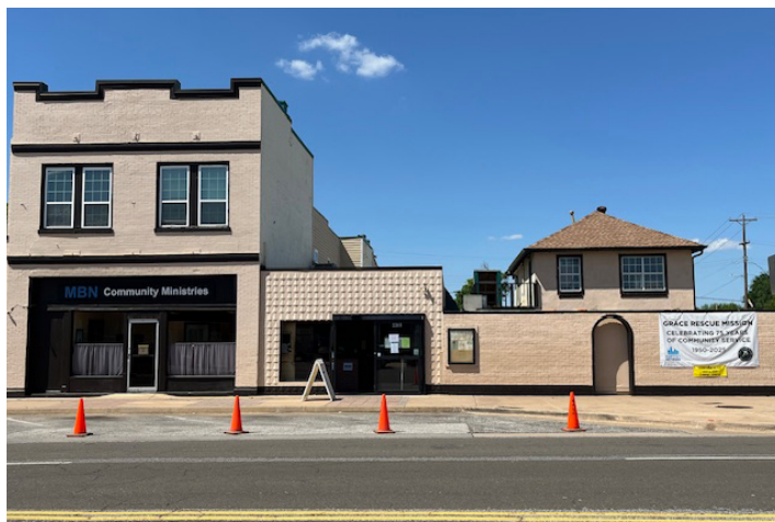
Grace Rescue Mission, located at 2205 Exchange Ave.