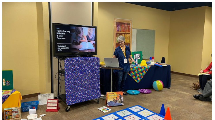
Photo from 2022 Heart of the Child Conference.