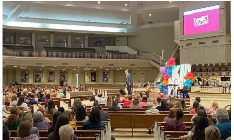
Photo from 2022 Heart of the Child Conference.